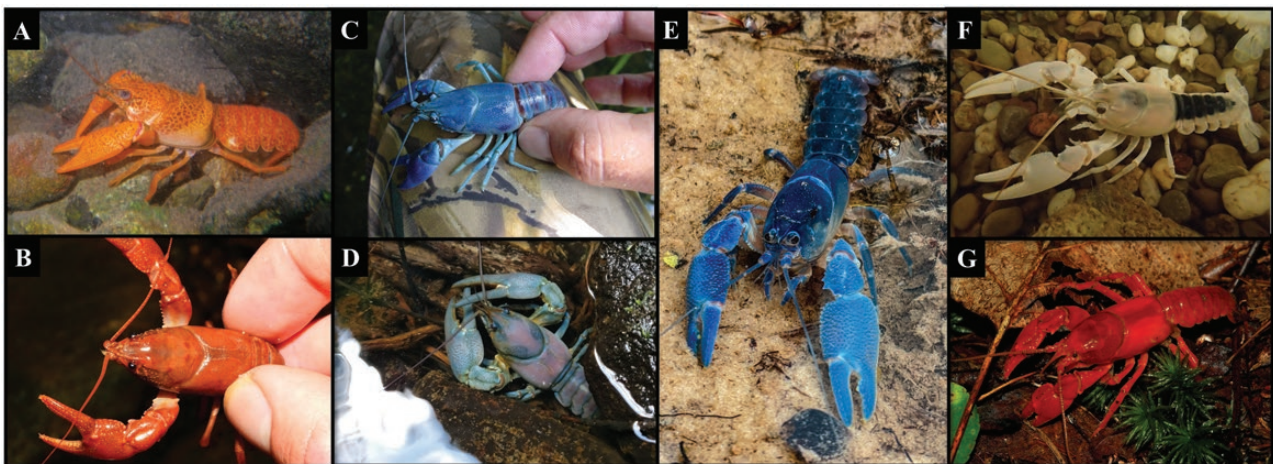
Figure 1. Color variants throughout freshwater crayfishes. Orange phenotype in Faxonius nana (A) and Cambarus bartonii (B). Blue-color phenotypes in Faxonius rusticus (C), Pacifastacus leniusculus (D), and Spinastacoides inermis (E). White-color mutation in Faxonius propinquus (F). Red-color phenotype in Cambarus asperimanus (G). All species presented below are typically cryptic colored (i.e., brown, tan, etc.).

Because of their prevalence, much of my discussion focuses on blue variants, although the same arguments and rationale I discuss below could equally apply to other color variants. For example, the genes responsible for blue-color mutations in crayfishes are unknown, but inheritance studies have been conducted on blue phenotypes in two species: Cherax destructor Clark, 1936, and Procambarus alleni Faxon, 1884. Despite being from separate families, blue mutations in both species are the result of a